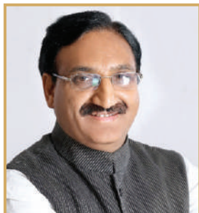
रमेश पोखरियाल 'निशंक' मानव संसाधन विकास मंत्री

स्टार्ट-अप इंडिया भारत सरकार की एक प्रमुख पहल है, जो नवीन आविष्कारों को हाथ में लेने, सहायता और प्रोत्साहनों के वित्त पोषण, उद्योग-शैक्षणिक भागीदारी और इन्क्यूबेटरों के बुनियादी स्तंभों पर आधारित है।